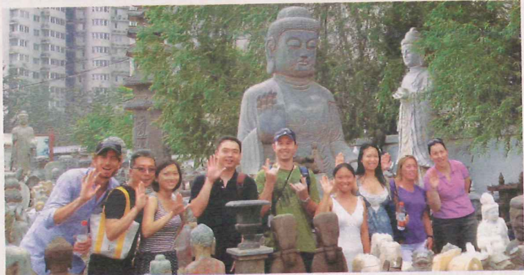
Lost and delirious, new staff pause for some enlightenment.

- Participation by new teachers, their families, and volunteer staff and students—all with cameras to record